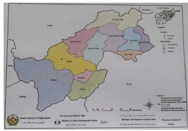
Figure 1. Administrative units of Paktia province

Map of administrative units of Paktia province