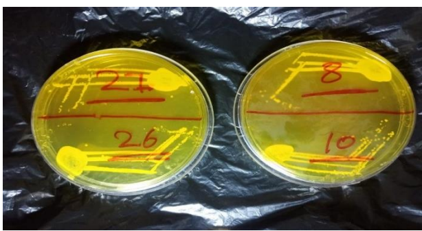
Figure 1: Staphylococcus aureus on Mannitol salt agar

of 7.5% Nacl also The Coagulase test yielded a positive result, and on Mannitol Salt Agar, Mannitol Fermenters showed up as yellow colonies. (Figure-1).