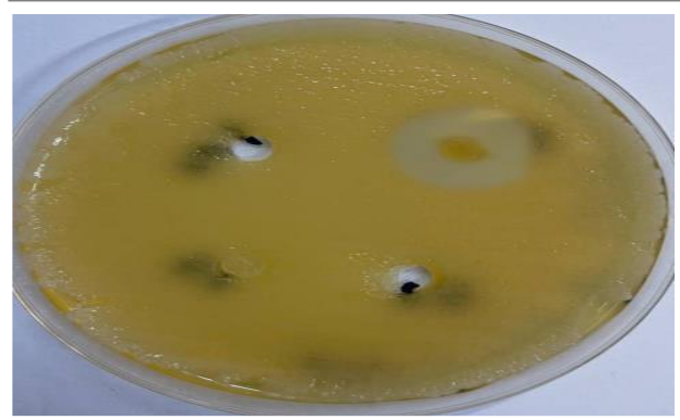
Figure 4: Effect of plant extracts on S. aureus growth.

The results of the presented study showed similarities with other results of previous Iraqi studies that were conducted to determine the antimicrobial activity of T. orientalis , and it was effective in inhibiting microbes against some pathogenic microorganisms including S. aureus [1]. Another study done in Saudi Arabia showed a moderate effect of T. orientalis extract [8]