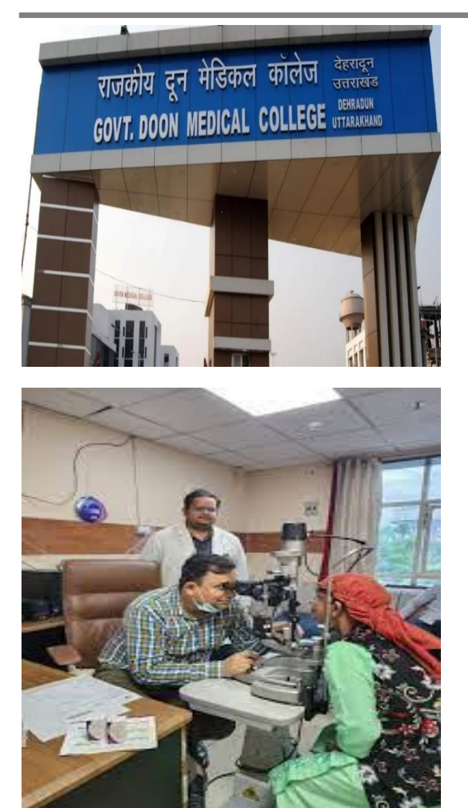
Figure: 1 (a) Govt doon medical College (b) Department of Ophthalmology check patients